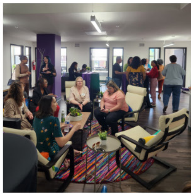
Guests and staff enjoy the spacious lobby area.